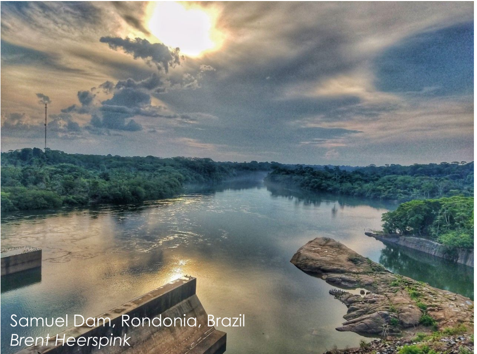
Samuel Dam, Rondonia, Brazil