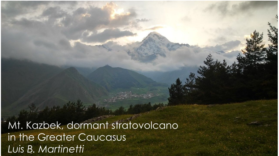
Mt. Kazbek, dormant stratovolcano in the Greater Caucasus